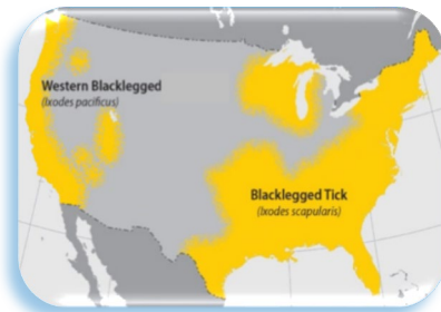
EL Maloney, composite of CDC maps

Many areas of the country are at high risk for Lyme disease. Wooded or forested regions that provide suitable tick habitat are especially at risk and breaking these areas into smaller parcels increases that risk. This map depicts where blacklegged ticks are commonly found.